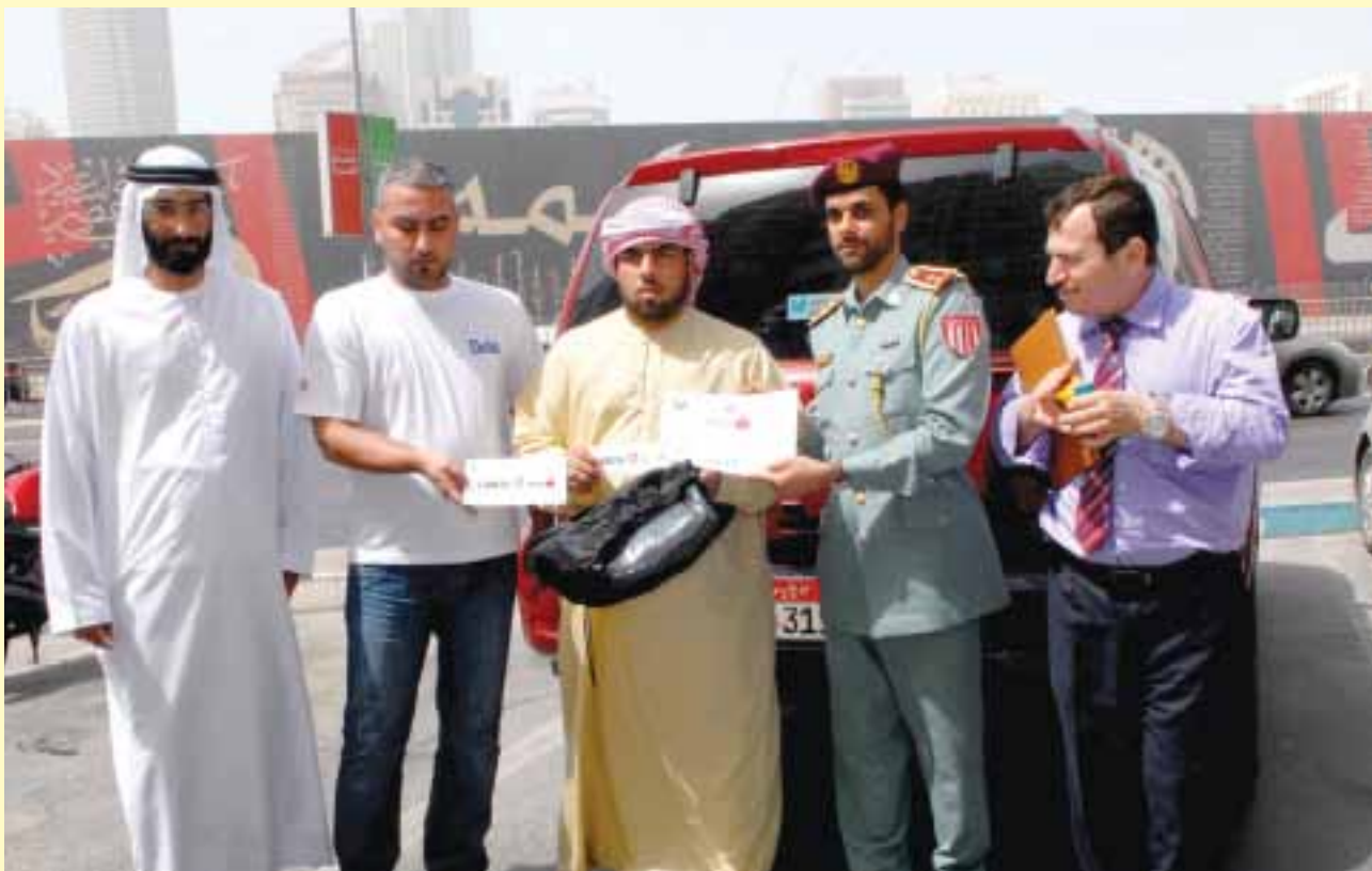
Part of the honoring celebration.

«They have been selected to be the Winners of the “The Star of Street Award