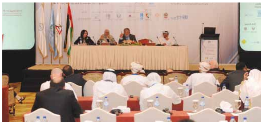
Consolidating the efforts to encounter traffic accidents is very important.

The symposium emphasized the importance of the involving all community events and the concerned organizations in guiding and observing people behaviors on road. Finally the symposium called for arranging awareness and preventive campaigns to make strategies for reducing the rates of death and injuries.