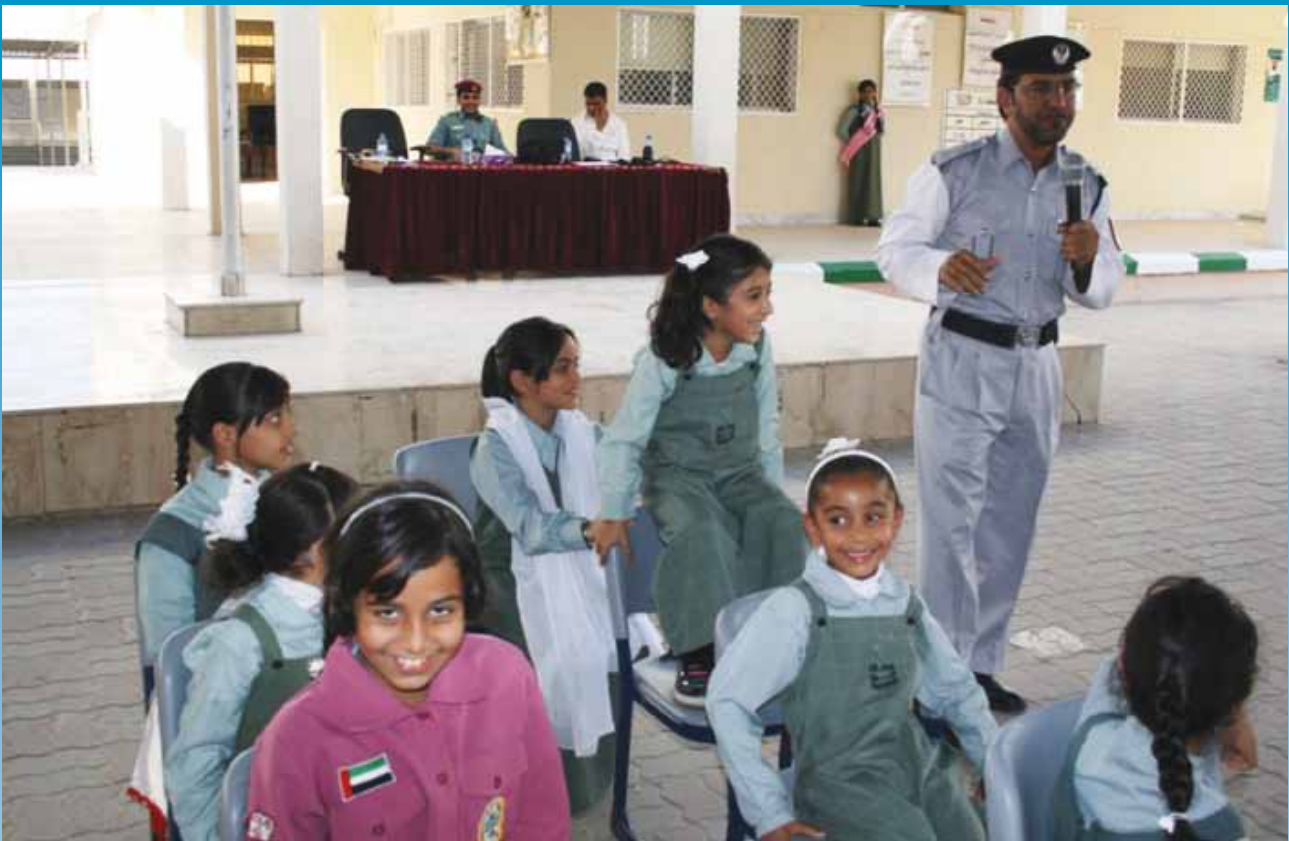
Traffic awareness instills the concept of social responsibility of the students