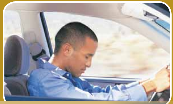
Taking certain medications when driving the vehicle is causing a lot of traffic accidents