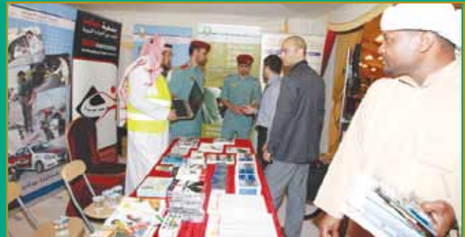
Part of the events of Saaed Association in the Village of the Ministry of Interior