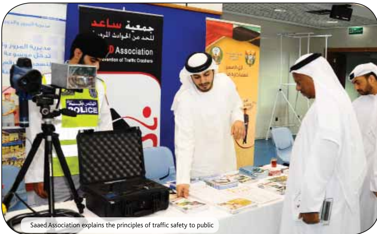
Saaed Association explains the principles of traffic safety to public