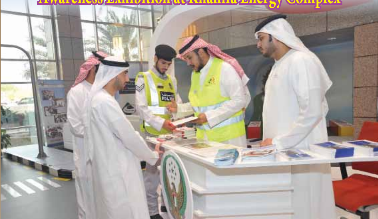
The participation of Saaed Association in Borooj and Takreer Campaign for Health, Safety and Environment 2012

Traffic and Patrols Department at Abu Dhabi Police, in coordination with Saaed Association, to control the traffic accidents organized awareness program within Borouge and Takreer Campaign on Health, Safety and Environment Program 2012, at Sheikh Khalifa Energy Complex in Abu Dhabi between 8 and 12 April. This comes within the approach of communication and the strategic partnership between the Department and the oil companies, leading to