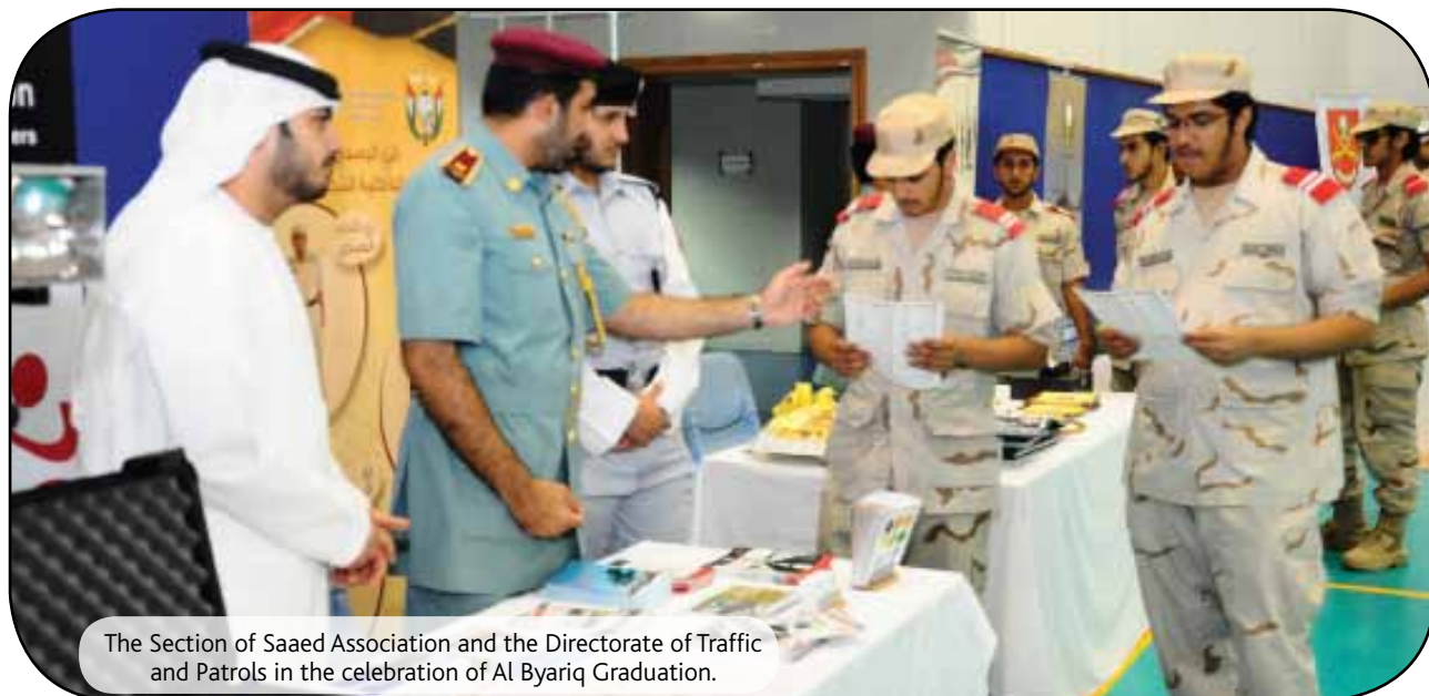
The Section of Saaed Association and the Directorate of Traffic and Patrols in the celebration of Al Byariq Graduation.

Saaed Association for Prevention of Traffic Accident took part in the graduation ceremony of 600 students from the Military Education Program «Banners» for 12 grade students, in which 15 secondary schools in Abu Dhabi participated.