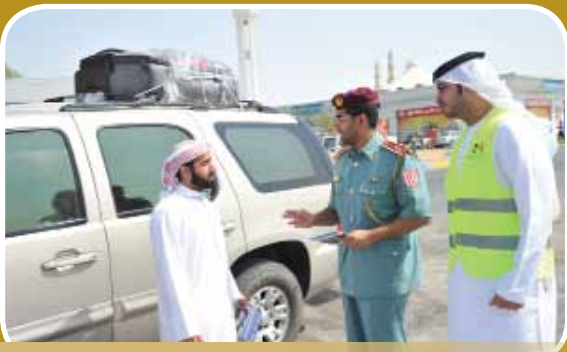
Saaed Association awareness of procedures” for individuals to travel for their own safety