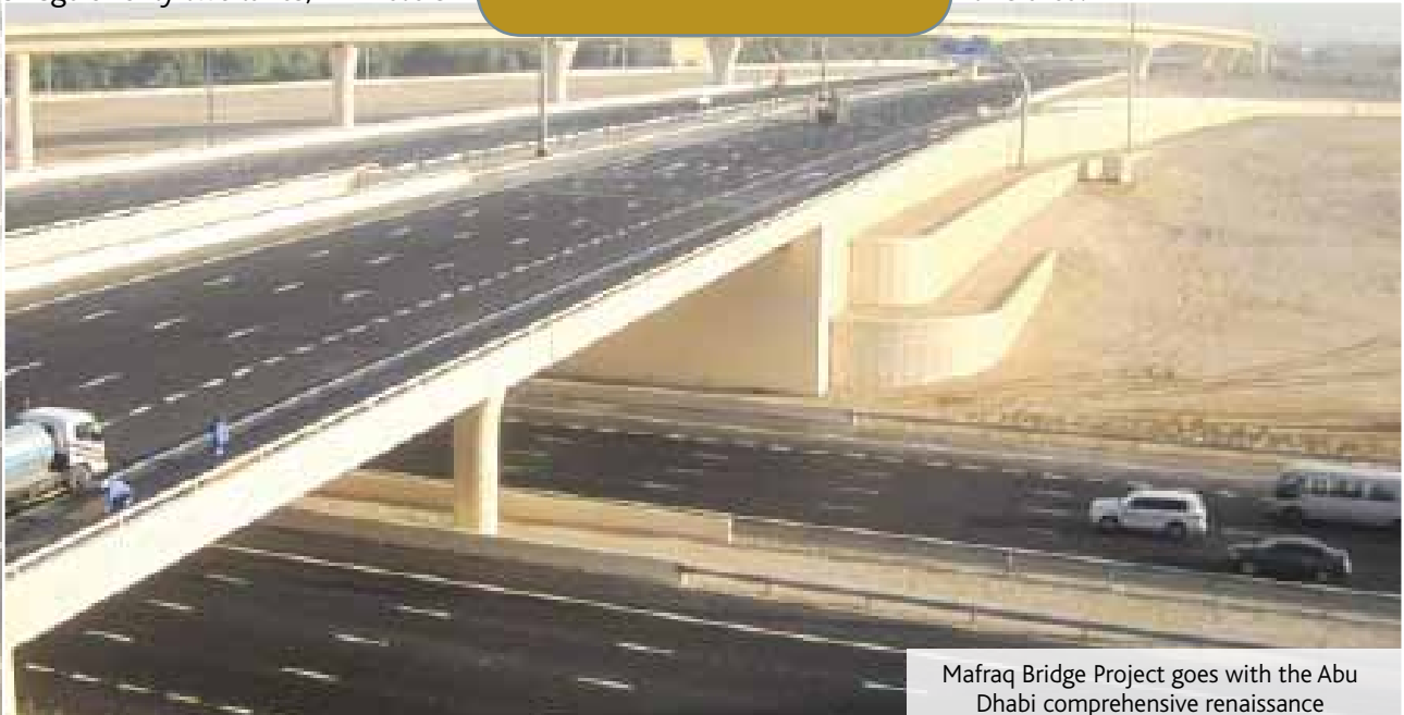
Mafraq Bridge Project goes with the Abu Dhabi comprehensive renaissance

The Municipality endeavors to go along with the urban renaissance, the requirements of development, to meet the needs of the current and future population expansion , to provide a modern roads and transportation net that can go along with expansion that Abu Dhabi is witnessing