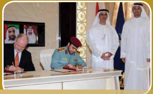
Saif bin Zayed attends signing of a memorandum of understanding between the Abu Dhabi Police and «Motorsports Management»