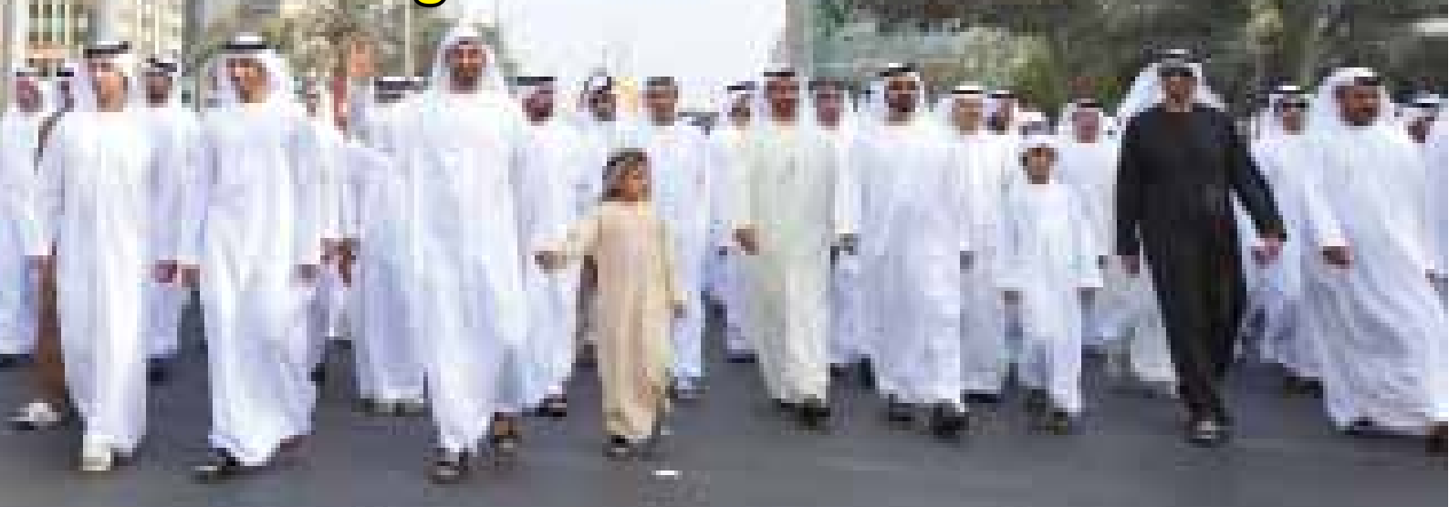
Their Highnesses at the forefront of the march

Progress of His Highness Sheikh Mohammed bin Rashid Al Maktoum, Vice President and Prime Minister and Ruler of Dubai and His Highness Sheikh Mohammed bin Zayed Al Nahyan, Crown Prince of Abu Dhabi and Deputy Supreme Commander of the Armed Forces and His Highness Sheikh Hamdan bin Mohammed bin Rashid Al Maktoum, Crown Prince of Dubai national march celebration, which was launched today's era of Al Manhal Palace in the capital Abu Dhabi towards the fortress palace downtown where Hosn Palace Festival celebrations marking 250 years of its construction by the His Late Sheikh Dhiab bin Isa Al Nahyan.