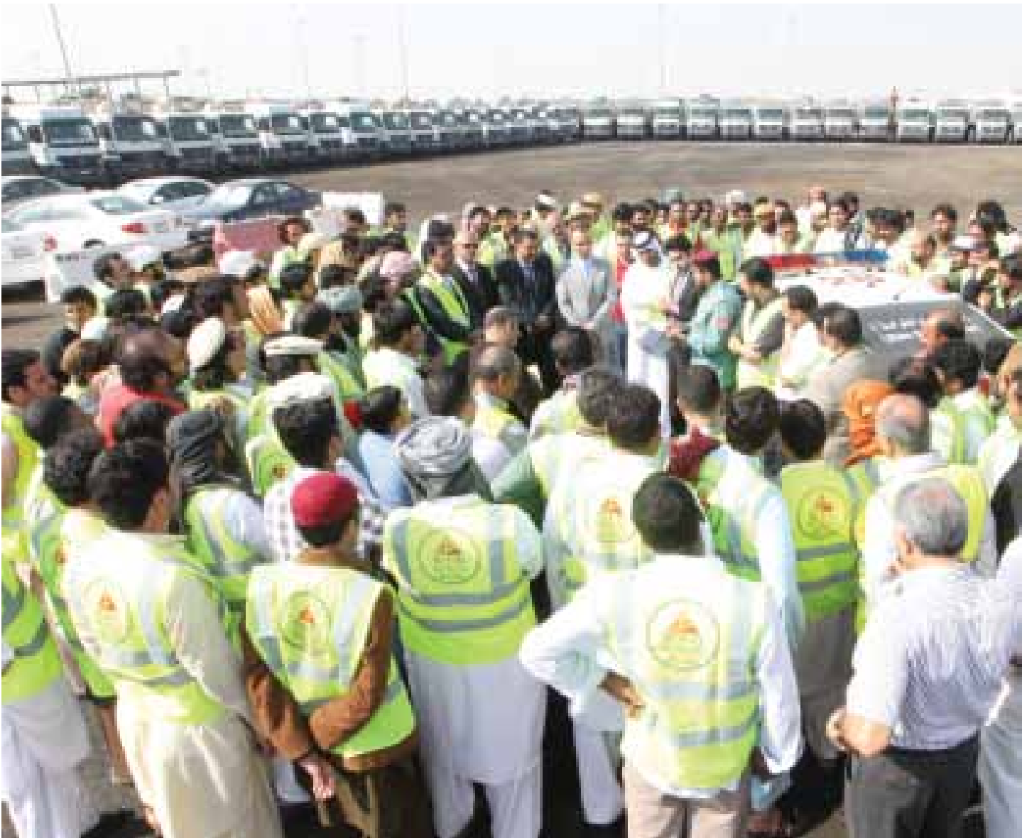
One of the elements of traffic for drivers explains how to drive safely.