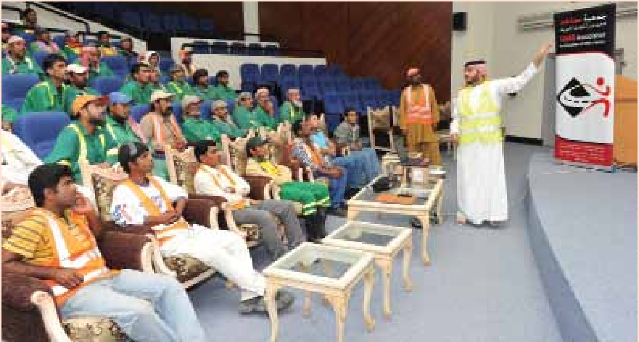
The side of the workers listens to the explanation of traffic awareness from Saaed Team

1,200 workers have benefited from the traffic awareness organized by