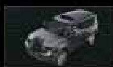
Hydraulic Body Motion Control System