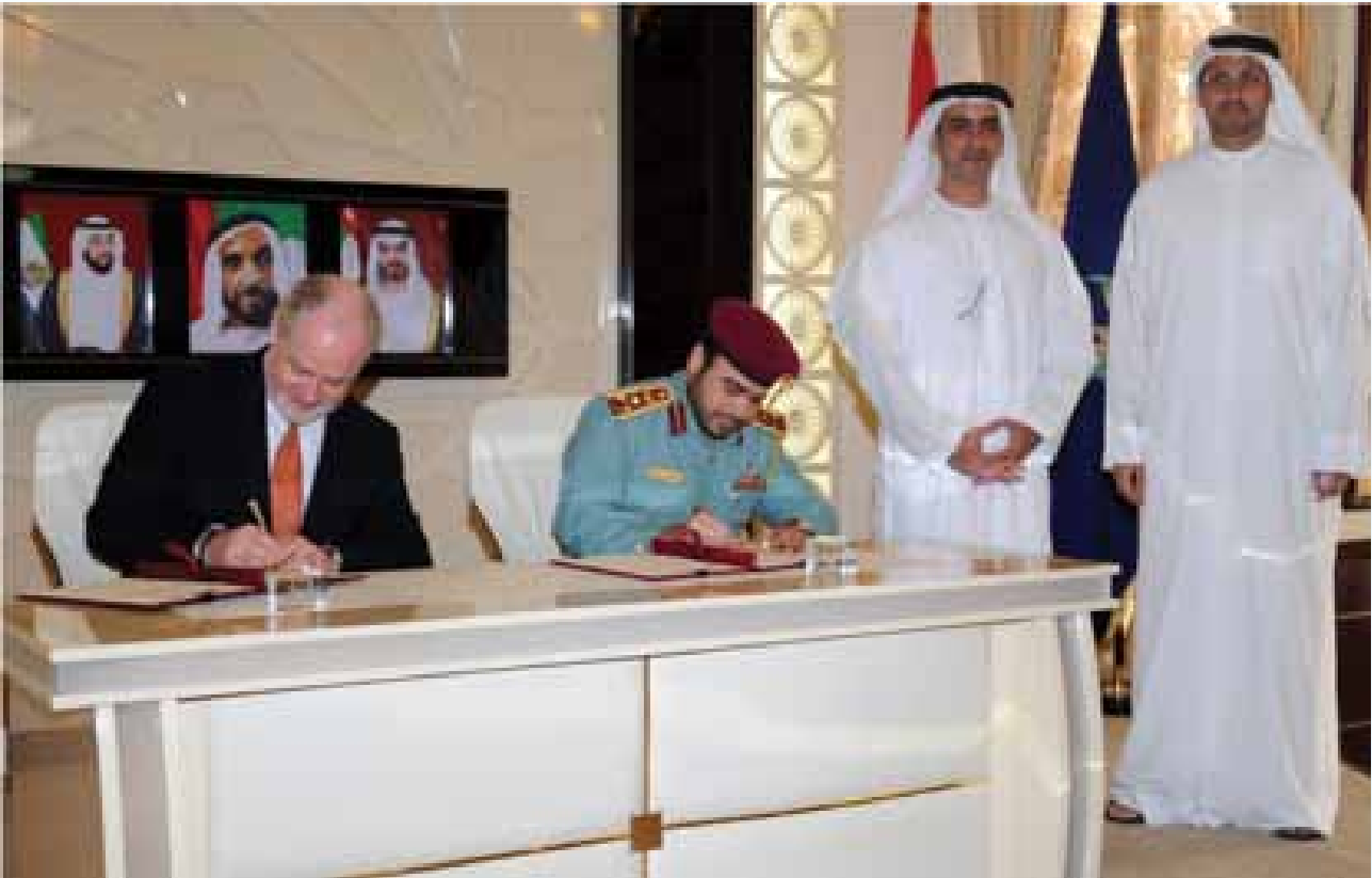
Saif bin Zayed during the signing of the agreement