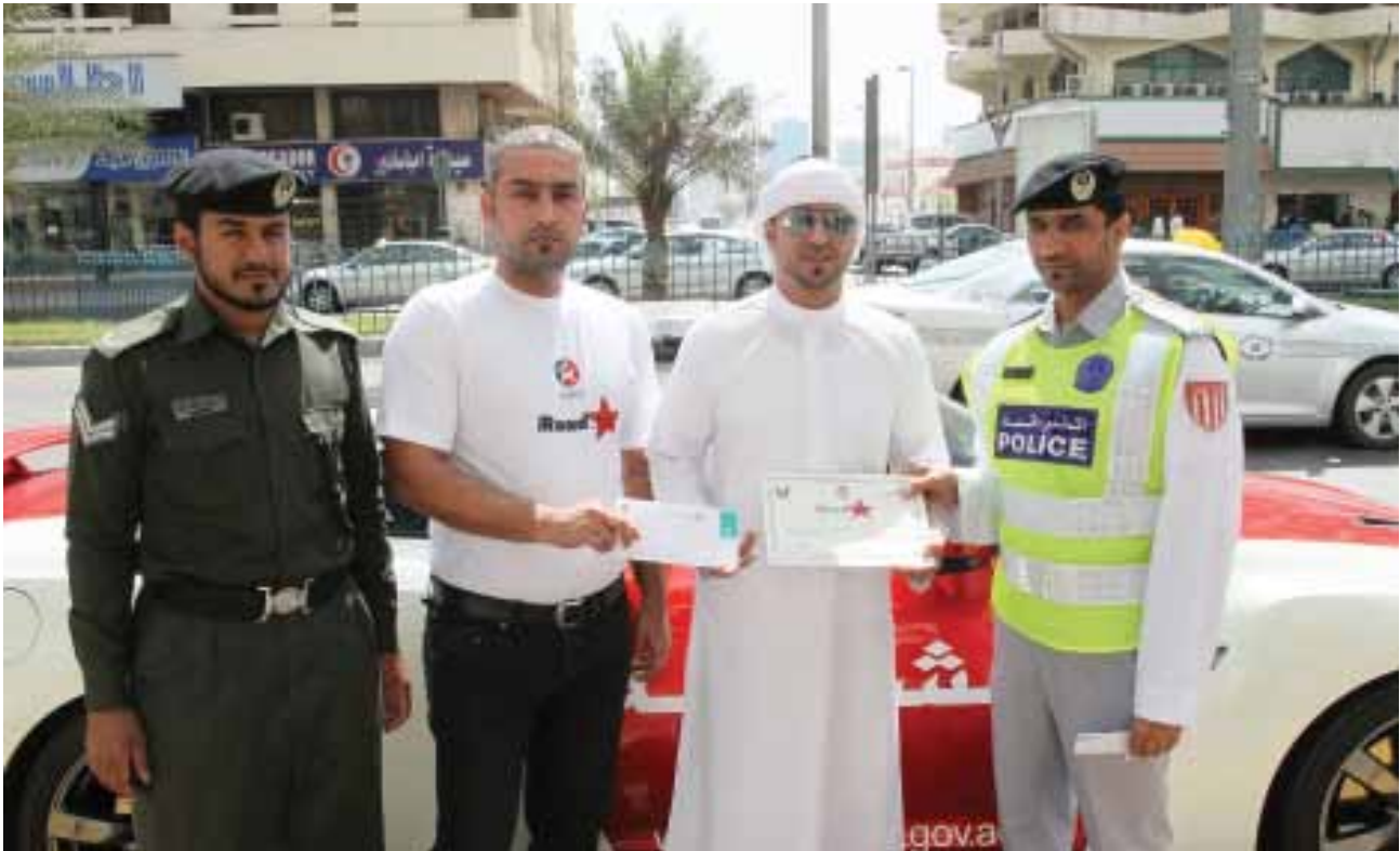
Two drivers receiving honoring gift

14 drivers receiving honors from the Directorate of Traffic and Patrols at Abu Dhabi Police in cooperation with the Federation of UAE motorsport, motorcycles and Saaed Association for Prevention of Traffic Crashers during the contest way as the star of the most committed of traffic laws and regulations during the leadership of the different ways in Abu Dhabi,