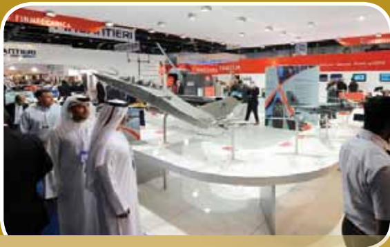
«IDEX 2013» establishes Abu Dhabi's position on the map of international exhibitions industry