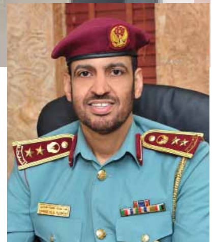
Colonel "Hamad Mubarak bin Osais Al-Ameri

"Al-Ameri" explained that passing cars through the side lane of the road are monitored by cameras to identify violators of traffic laws at the intersections of the city of Abu Dhabi. Moreover,