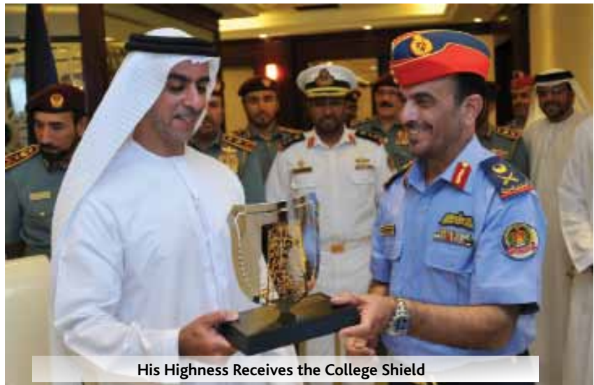
His Highness Receives the College Shield