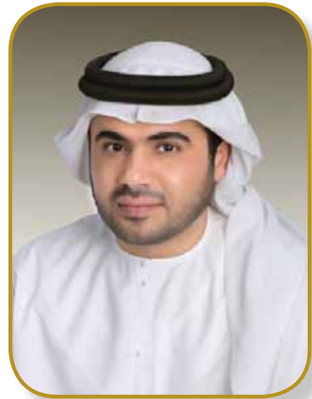
Chairman of the Board of Directors

We hope that society members use social media websites optimally and get to know all that is new and useful.