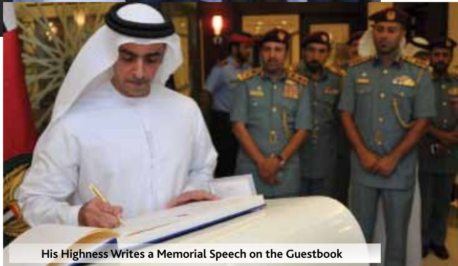
His Highness Writes a Memorial Speech on the Guestbook