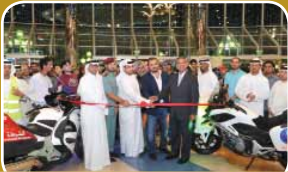
SAAED Participates in Abu Dhabi Exhibition and Motorcycles Parade