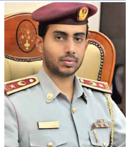
Lieutenant Colonel Mubarak Bin Mahiroum

He stated that these awareness activities include a series of lectures provided by Community Police in order to stress the necessity to comply with the rules, to be quiet during getting in and off the bus, to avoid violence with each other while participating in school activities, to