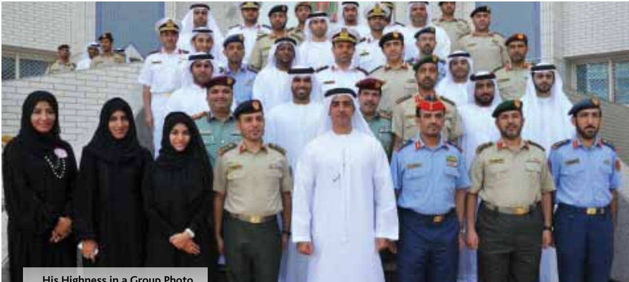
His Highness in a Group Photo with Class One Students

Lt. General Sheikh Saif Bin Zayed Al Nahyan, Deputy Prime Minister and Minister of Interior, stressed that the unique solidarity existing between the people of the UAE and the wise leadership is the major ground of our present achievements of unparalleled progress, welfare, security and stability. HH indicates that the responsibility of achieving a comprehensive security in order to be permanent in the homeland is not exclusively limited to military and police institutions, as all civil and private sectors are involved in this matter, pointing to the importance of permanent and effective coordination between these various components to achieve the overall objective.