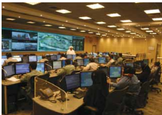
Advanced services operations room around the clock

Moreover, he explained the way of communication with users through sending a text message «SMS» on the number «5999» to report accidents and sickness cases provided that type of report, its location, type of injury are stated. Then, Operating Room receives messages through special program dedicated for this purpose provided with database including all categories of special needs people registered at Zayed Higher Foundation for Humanitarian Care and Special Needs. Meanwhile, Operating Room deals with reports by classifying them to «criminal or traffic» reports, ordering the patrol to go to the event site and taking the necessary measures.