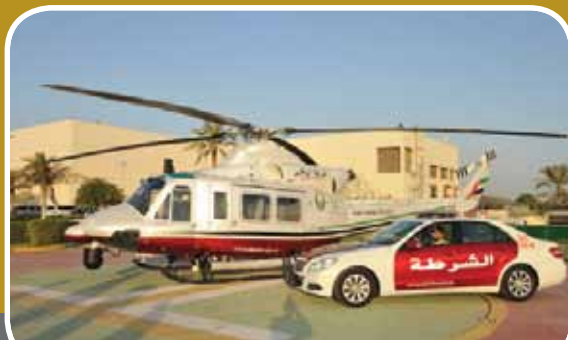
Air patrols to monitor roads and arrest traffic law violators in Abu Dhabi