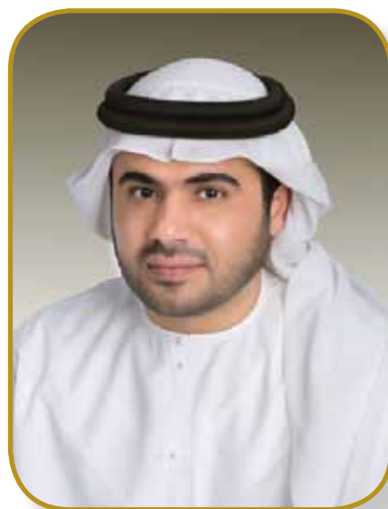
Chairman of the Board of Directors Brigadier Engineer

The law prevents any person from driving any motor vehicle on the road, unless the holder of a valid license, issued by the licensing authority, conferred the right of the vehicle driven by the type of leadership, and no person may be responsible for a motor vehicle, that allows those leadershipIt does not hold a license conferred leadership.