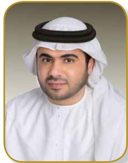
Chairman of the Board of Directors Brigadier Engineer

On this great national occasion, I would like to express my sincere congratulations to His Highness Sheikh Khalifa bin Zayed Al Nahyan, President of the UAE; His Highness Sheikh Mohammed bin Rashid Al Maktoum, Vice President, Prime Minister and Ruler of Dubai; and His Highness Sheikh Mohammed bin Zayed Al Nahyan, Crown Prince of Abu Dhabi and Deputy Supreme Commander of the UAE Armed Forces. I pray for God Almighty to preserve our beloved UAE and our wise leadership... Happy New Year.