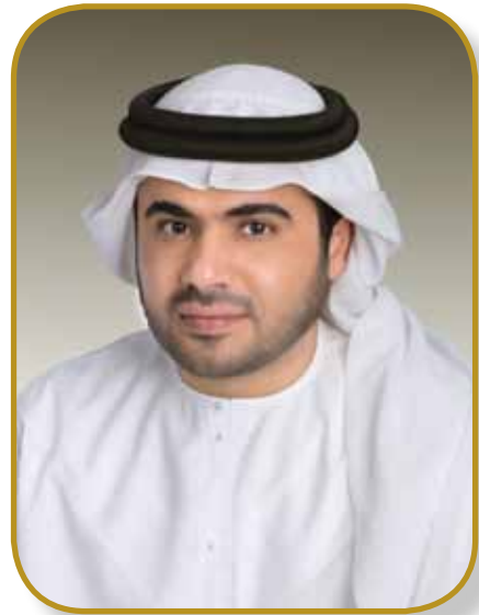
Chairman of the Board of Directors Brigadier Engineer

Through this campaign and the beginning of the new year, we try to raise traffic awareness. We work hard to utilize our power and capabilities to make it a success and to achieve the desired goals, which would keep all road users safe and to respond to the directions of our wise leadership which would stop at nothing to reduce fatalities caused by traffic accidents.