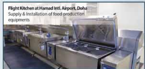
Flight Kitchen at Hamad Intl. Airport, Doha Supply & Installation of food production equipments

We have footprints in Residential, Commercial, Mixed Use, Hospitality, Healthcare, Industrial and Oil & Gas Sectors.