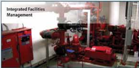
Integrated Facilities Management