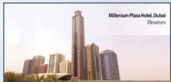
Millenium Plaza Hotel, Dubai Elevators