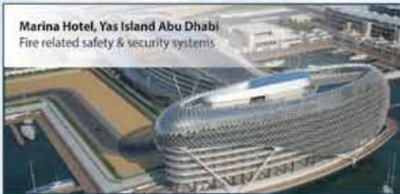
Marina Hotel, Yas Island Abu Dhabi Fire related safety & security systems