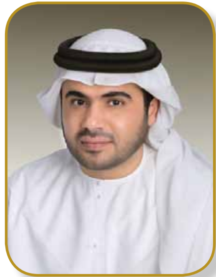
Chairman of the Board of Directors Brigadier Engineer

This is the initiative that comes to support the Abu Dhabi Police's efforts in improving the behavior of road users, and applying laws and safety standards next to increase awareness and public education, such as increased rates of use of seat belts and helmet and reduced speed, safe passage for the road; and other risks that cause traffic accidents.